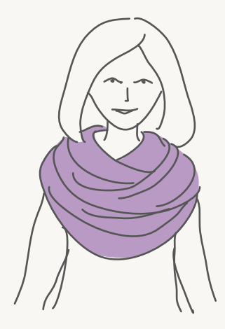
To make a cowl, pull Mobius up over your shoulders and to the front, twist & loop over the head