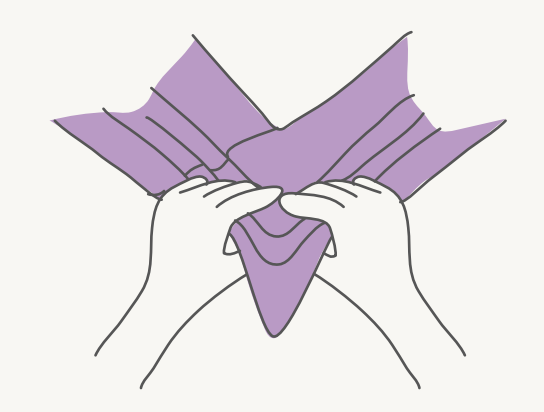
Hold the point of the Mobius, gather the fabric at the "V"